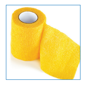
Add cylindrical foam tubing or Coban Self-Adherent Wrap to objects for a better grip. Inexpensive foam tubing is great for enlarging utensil handles and can be purchased at any hardware store that sells pipe

Use mats on the counter to stabilize pots, pans, cutting boards, and plates and keep them from sliding. Options include Dycem nonslip products (www.dycem-ns. com/occupational-therapy) and silicone webbed mats that can accommodate hot objects.