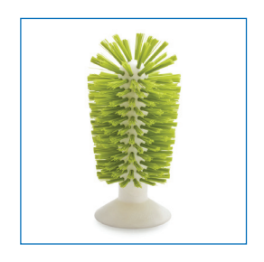
Attach a suction brush to the sink wall, and use it to scrub fruits and vegetables.