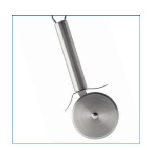
Use rocker-style, curved knives; rolling pizza cutters; and a mandoline food slicer. With these utensils, it's easier to cut food using only one hand.