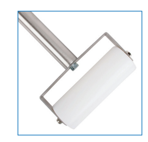
Take advantage of a one-handed rolling pin—one of the best tools ever.