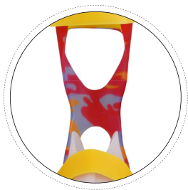
Alternate option Semi-rigid posterior strut